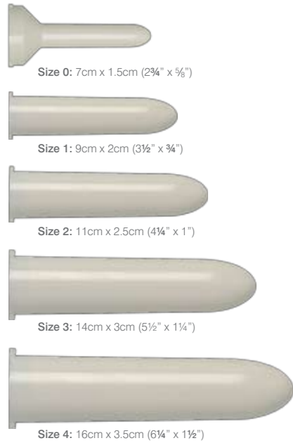
Size 0: 7cm x 1.5cm (2¾" x 5/8")