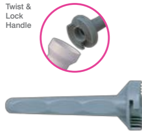
Twist & Lock Handle

Amielle Comfort Product Code: SM2100 PIP Code: 270-6174