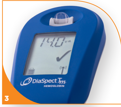
Results appear in 1 - 2 seconds